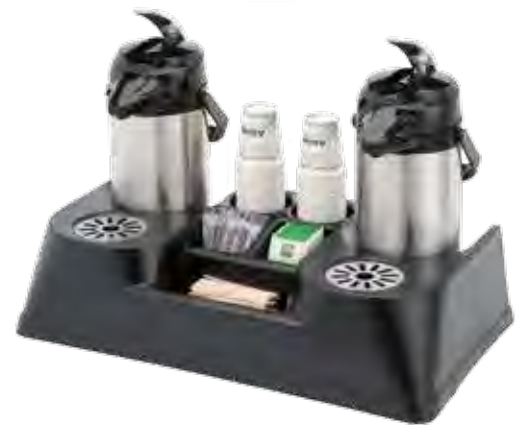
Thermos jug buffet

Stylish and practical presentation of hot drinks for serving table arrangements. Suitable for both types of the thermos jugs with pump.