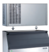
SB 193 SB 322