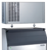
SB 393 SB 530